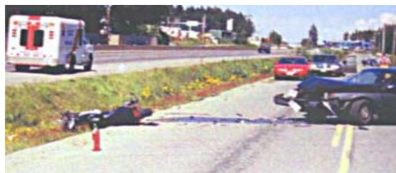
Speed Analysis for Traffic Accidents & Reconstruction

EPES has developed a niche expertise in the investigation analysis and bio-remediation of environmental contamination of soils and groundwaters. Many of their projects have involved various aspects of geo-environmental engineering including storm water & drainage/erosion studies; chemical contaminant analysis; fecal coliform contamination analysis and monitoring of safe swim beaches for Municipalities, Health Authorities and Port Authorities. EPES conducts investigations as well as remediations of accidental hydrocarbon spills resulting